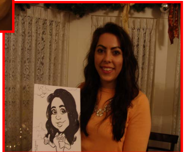
We had a lot of fun with the caricature artist!