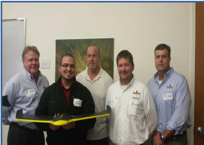
Shawnee Professional Services presented “Surveying the Right of Way with Drone Technology”