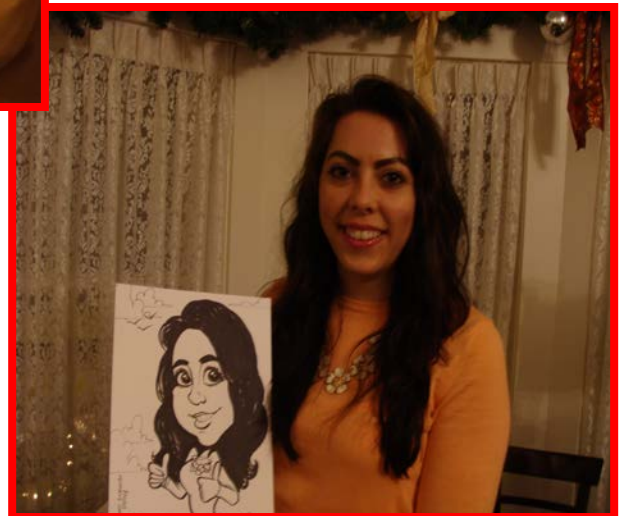
We had a lot of fun with the caricature artist!